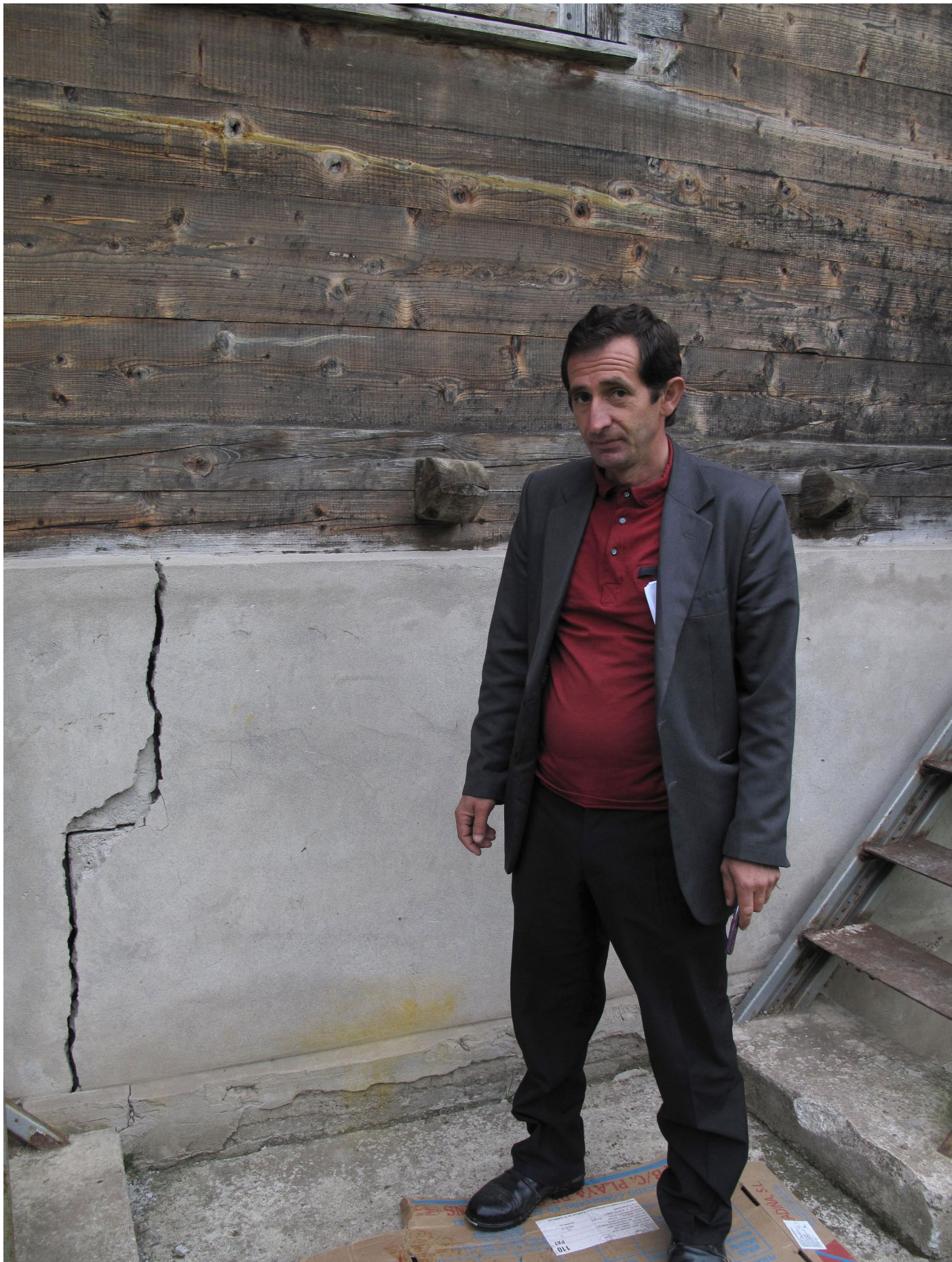
Lost in transition: 25 years of the EBRD