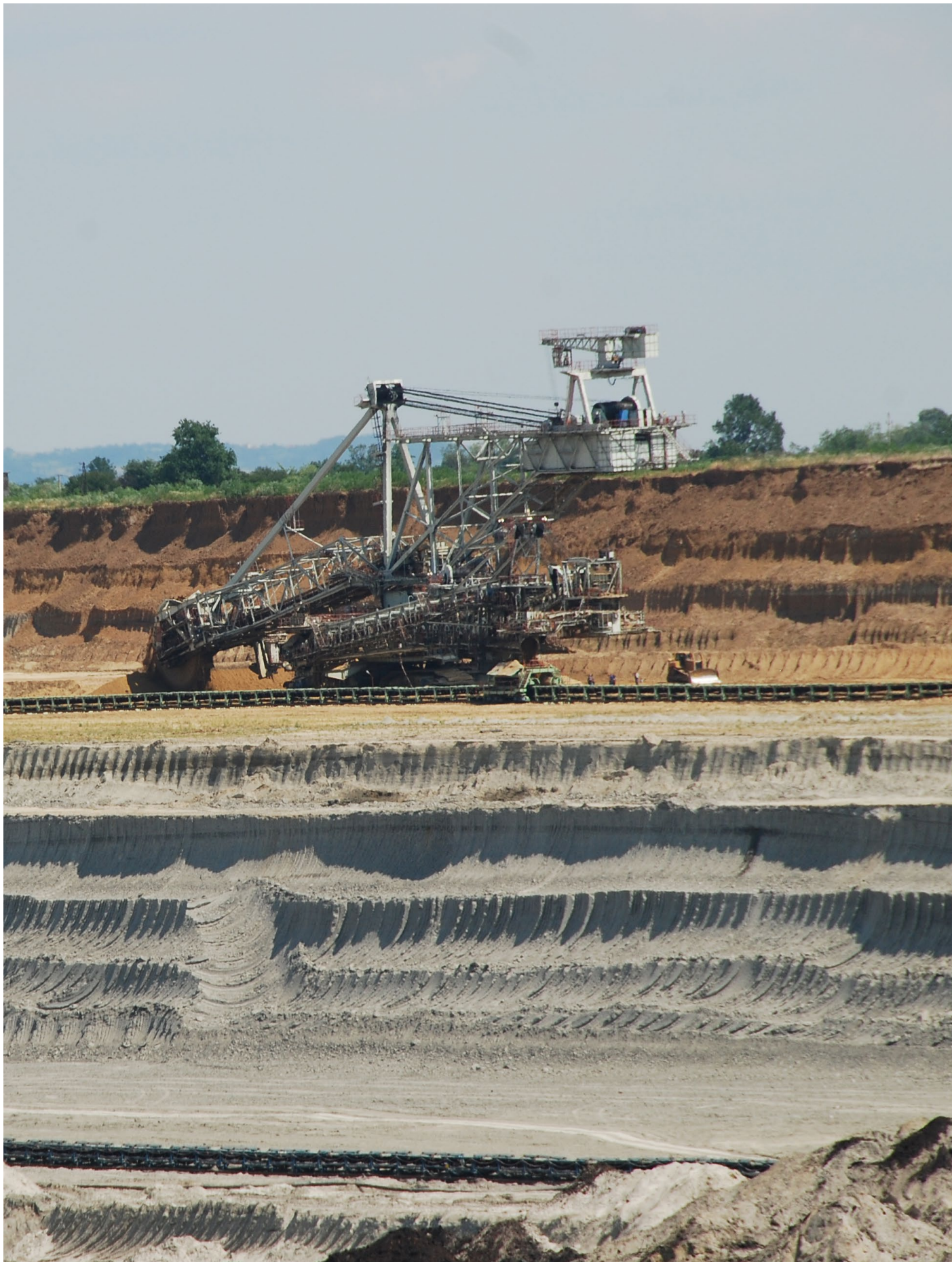
Lost in transition: 25 years of the EBRD