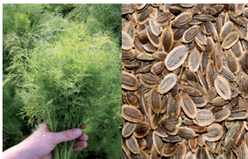
Kopr vonný a osivo kopru vonného