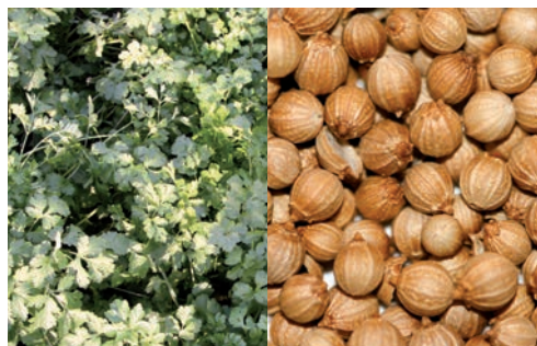
Koriandr setý a osivo koriandru setého