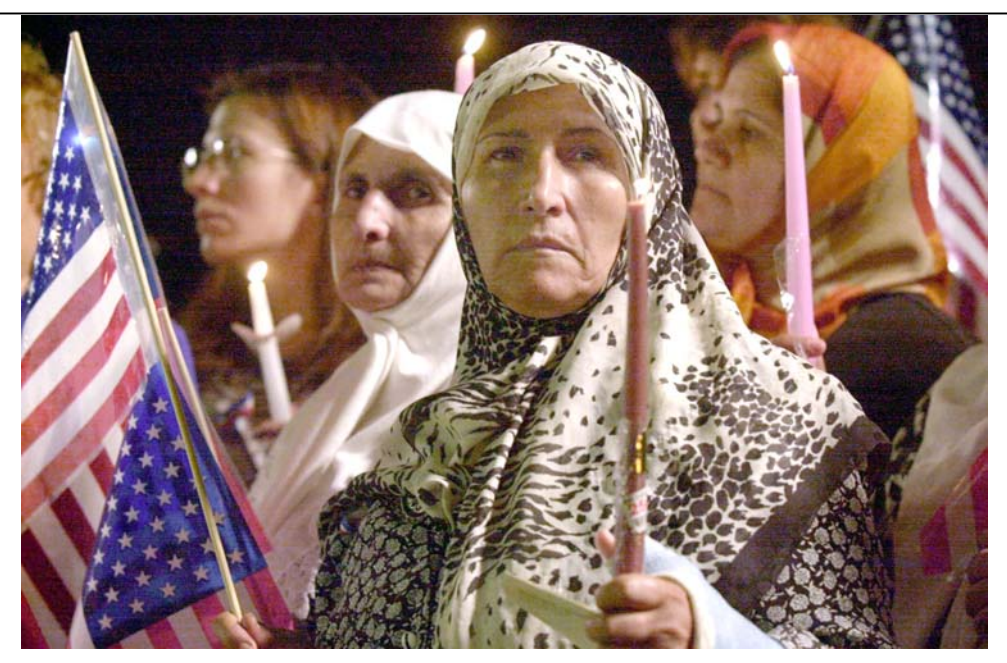
Members of the Arab-American community in Detroit, Michigan participate in a candlelight vigil in remembrance of the September 11 attack victims. September 19, 2001.

Those who feel like they can intimidate our fellow citizens to take out their anger don't represent the best of America, they represent the worst of humankind, and they should be ashamed of that kind of behavior.