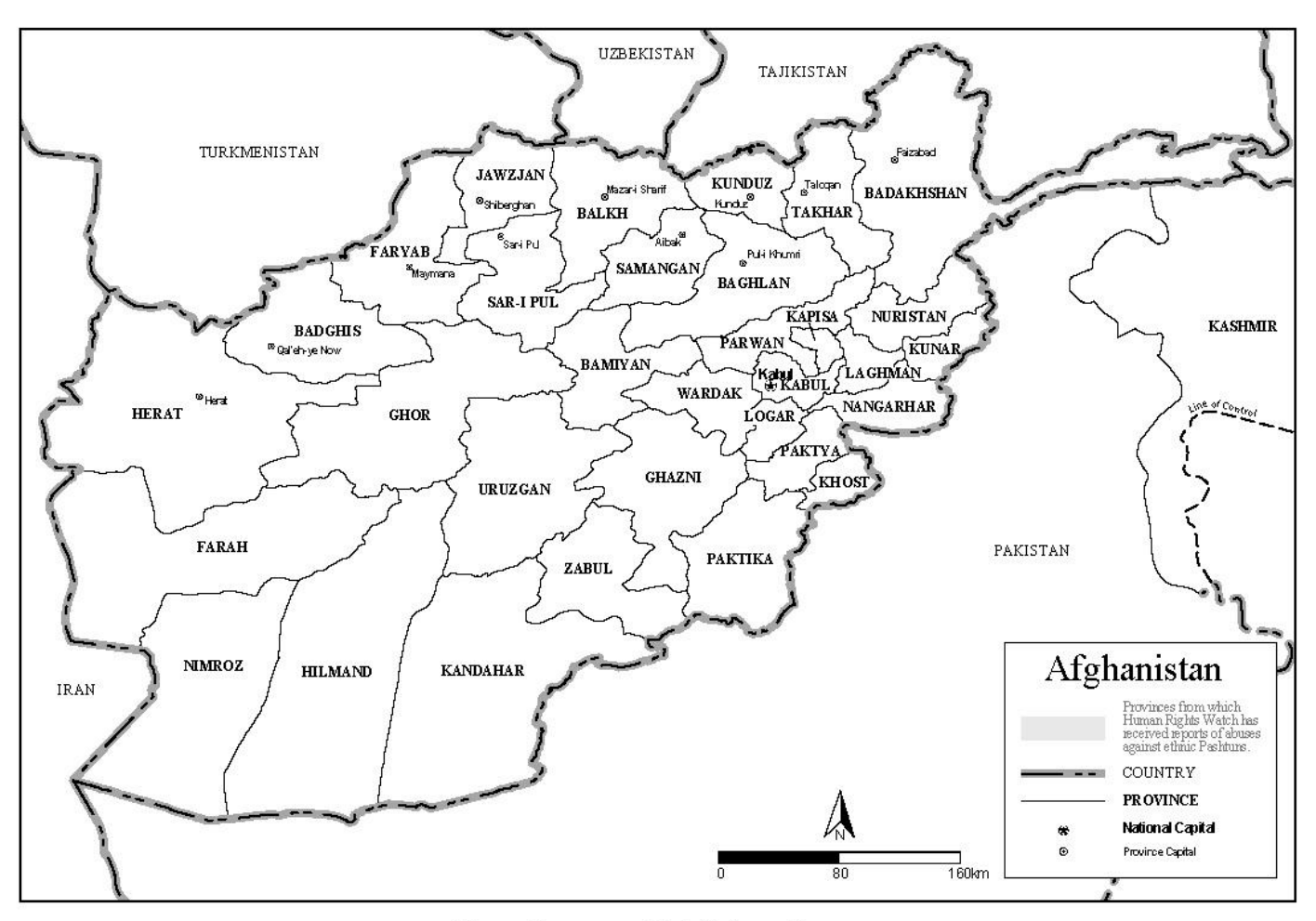
Provinces of Afghanistan