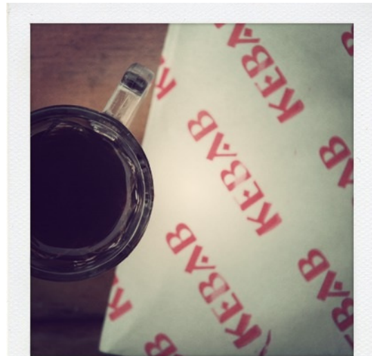
Mr X, 35 years old, Syria, 1 year 9 months in Poland „I'm still waiting...”