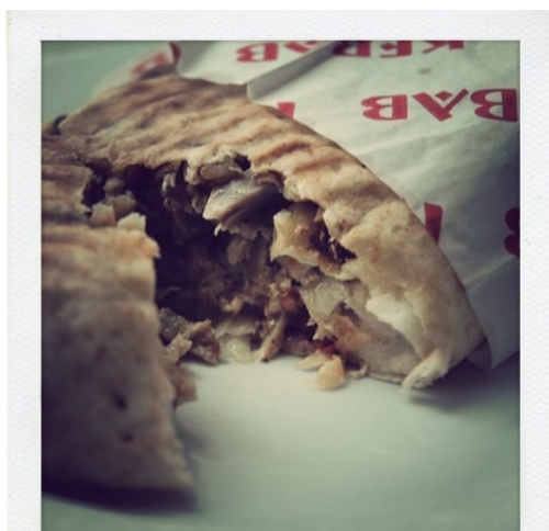
Mr X, 35 years old, Syria, 1 year 9 months in Poland „I'm an engineer, I work in a bar”