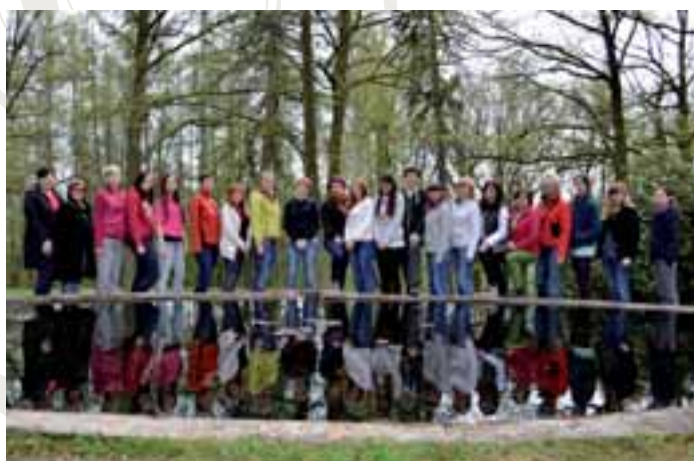
Volunteer training in the Na Pleši Hospital

Building on the uniqueness of our volunteer programme, Amelie has been organising its own training of volunteers since 2008, in a form of 3-day courses that focus on the specific requirements of oncological patients. The other unique feature of our training programme is the fact that the courses and participation in our volunteer programme are open to people who went through cancer treatment themselves. Amelie places great emphasis on thorough preparation and keeps enhancing the skills of the team of specialists in the field of oncology and volunteering. Thanks to our professional trainers, the participants of our courses have an opportunity to ask specific questions while visiting the hospitals and oncology wards. The training courses are held in the hospitals Na Pleši and in Olomouc.